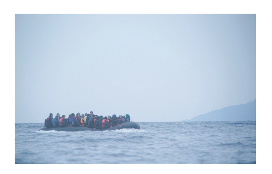
Fig. 4: Refugees on a boat crossing the Mediterranean Sea, heading from the Turkish coast to the northeastern Greek island of Lesbos, January 29, 2016.

southern Europe, and the tragedy of refugees crossing Greek borders by the thousands have challenged ideas about global geopolitics. Debates over the meaning and future of Europe revolve around the Mediterranean. Border control and surveillance occupy officials in meetings, families of migrants, and the opinions of the public. And yet, following Braudel, most of the existing historiography ends around 1500. At that point, the argument goes, the Atlantic World obscured the significance of the Mediterranean Sea to world history. The Strait in the Cold War aims to change our visions of the modern Mediterranean, making historical sense of its current visibility. This is a contribution to a growing literature on the construction of new oceanic spaces through science, war, and law. This revolution in mari-