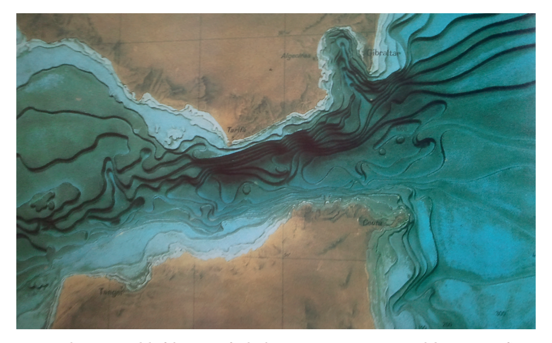
Fig. 3: Bathymetry model of the Strait of Gibraltar ca. 1932, Instituto Español de Oceanografía.

authorities of numerous countries. From the 1940s and well into the 1990s, scientists and navy officials from more than ten nations endeavored to map converging currents. They did so through secret bilateral agreements as well as through transnational collaborative efforts such as the International Geophysical Year (1957-1958), the NATO Subcommittee for Oceanography (1959-1975), and the Gibraltar Experiment (1985-1995). In this account, the Strait becomes a chokepoint for entangled histories of worldwide underwater surveillance and the construction of the global ocean in scientific and environmental senses.