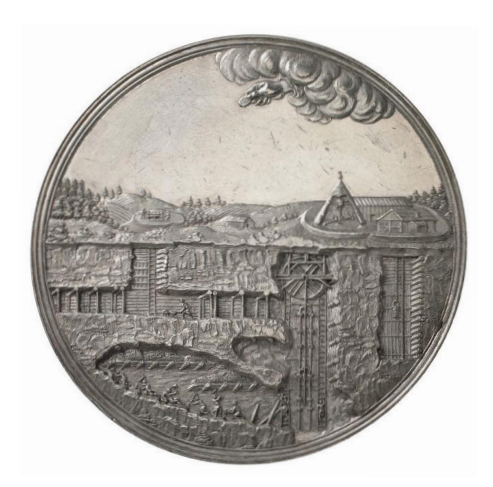
Fig. 1: This commemorative silver medal marked the completion of an aquaduct (shown on the obverse) as well as the first payment of a dividend after years of loss. Münzkabinett, Staatliche Museen zu Berlin, Inv. Nr. 18207762.

poorer, while more sophisticated technology was needed for their extraction. Heavy machinery was built to lift people and materials, and air was pumped into unnatural depths; water was gathered to push wheels and help drain the lower galleries. Costly process architectures emerged in order to move the ore from the rock, to crush it, and to melt the metal out of the dust. The need for coordinating the various works necessary in underground mines created environment in which bureaucratic an routines-clusters of regulated practices that dovetailed the efforts of different people with different roles-could emerge and thrive. The wheels, pumps, and shafts were thus just the more externally visible components of systems of coordinated labor, in which actors sought to stabilize inputs and outputs and turn the "gamble" of the early days into a source of