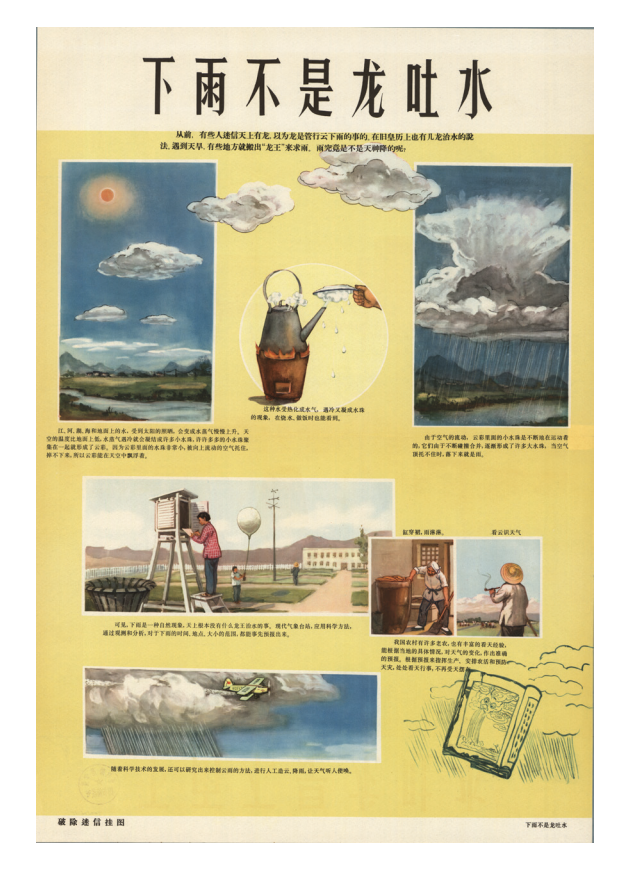
Figure 3: Woman taking measurements from meteorological instruments housed within a Stevenson screen and a person holding a weather balloon close by (centre left); depiction of an old farmer observing the clouds (centre right). "Rain Is No Dragon Spit" (下雨不是龙吐水), Science Popularization Press, December 1965.

Soon after the 3rd National Meteorological Work Meeting in 1958, People's Daily articles told various accounts of local ingenuity under the new system that also hinted at many problems that went beyond growing pains. The rapidly expanded number of stations suffered from having little to no experienced staff, whether