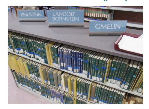
<u>02</u> Unhandy handbooks: reference section of the Chemistry and Chemical Engineering Library, University of California at Berkeley, spring 2020.

books "on hand," or held in the hand, for instruction, reference, even as a place to store additional handwritten notes. The differentiation between manual and handbook has never been clear-cut, and, to make things worse, French only knows the manuel , while German relies on the Handbuch . Yet, there is evidence that the spectrum of literature designated especially by the Germanic term changed significantly in the modern period.