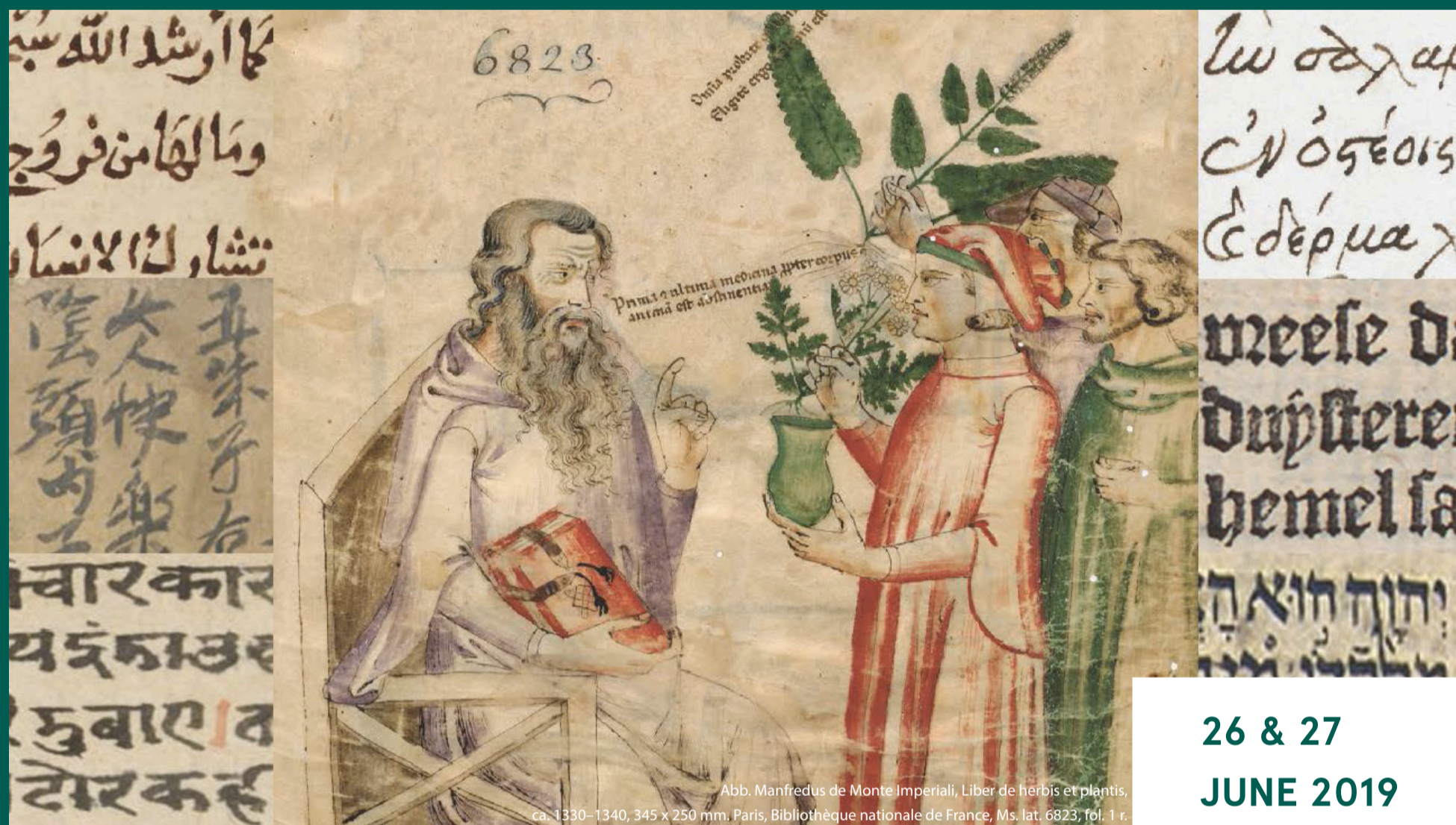
Abb. Manfredus de Monte Imperiali, Liber de herbis et plantis, ca. 1330–1340, 345 x 250 mm. Paris, Bibliothèque nationale de France, Ms. lat. 6823, fol. 1 r.