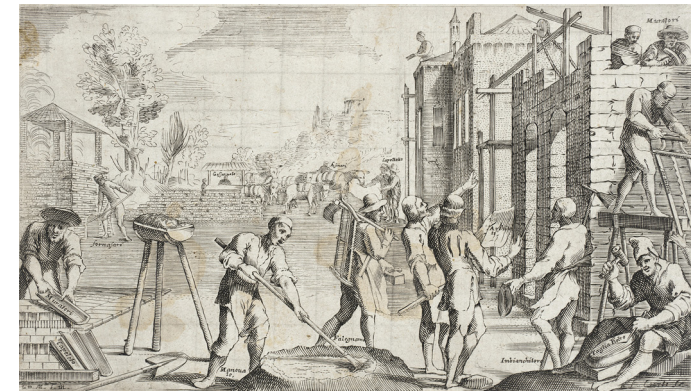
The Art of Building. From Virtù et arti essercitate in Bologna (c. 1640)