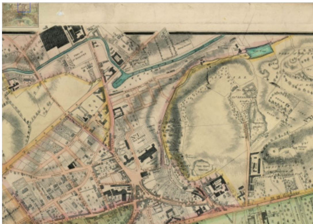
Illustr. 4: Section of David Smith, Plan of the City of Glasgow and its Environs , 1828.