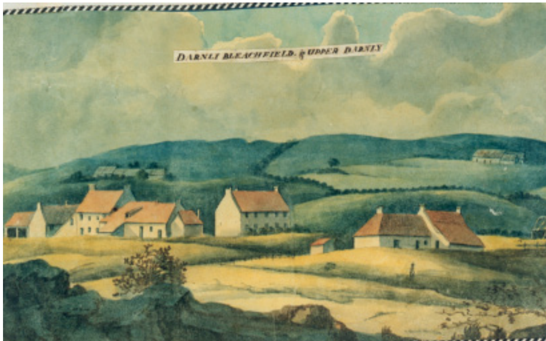
Illustr. 5: Darnley Bleachfield.