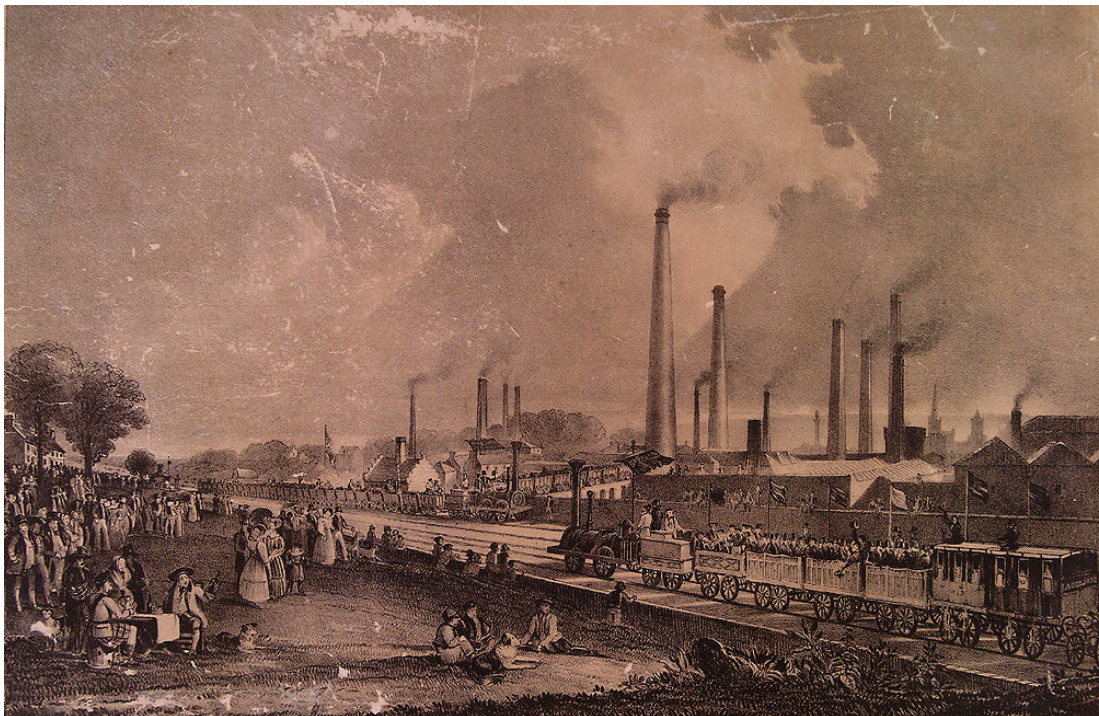
Illustr. 2: Engraving, David Octavius Hill, The Opening of the Glasgow Garnkirk Railway 1831 . St. Rollox Works in the background.