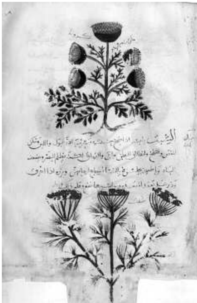
Image 1: Dioscurides, Carvi (BnF, Arabe4947, f63v; 12th c).

map and twenty-one regional maps) put together in the tenth century, preserved today in Gotha's Research Library.