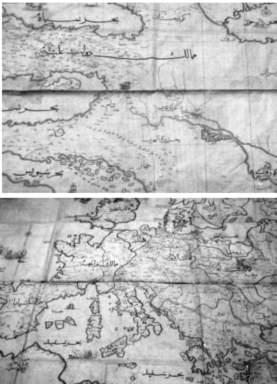
Image 10: Map of Europe and Asia (Istanbul, Archaeological Museum, Silk, Two Extracts).

While many of these presentations were made in the form of poems, a special prose form called munazara , that is, debate, was also used for discussing the relative merits of two opponents. In the munazara , in addition to the inanimate things of nature, human beings—among them representatives of professions such as physicians and astrologers—entered the fray. In such cases, the opponents belong to different ethnic groups, religions or regions—a physician from Kirman debates with a Greek astrologer, an Arab discusses with an Ajami, that is, a non-Arab, and mostly someone from western Iran, or a Muslim encounters a Zoroastrian. 38