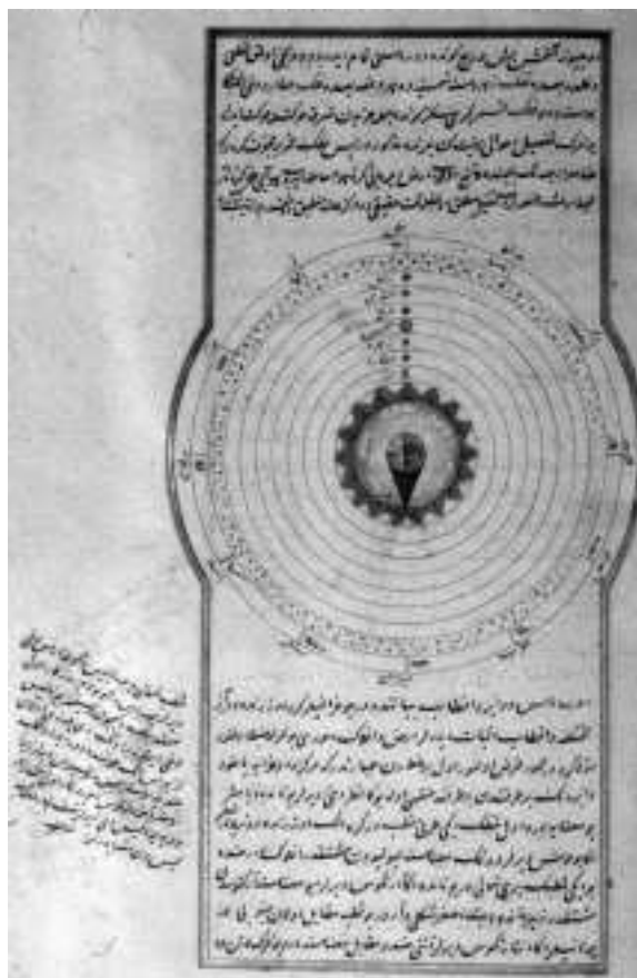
Image 8: Hajji Khalifa, Cihannüma , Ptolemaic Universe (Istanbul, Süleymaniye, Hamidiyye 988).

The autographs of Hajji Khalifa's and Mehmet Ikhlasî's translation as well as Hajji Khalifa's own geographical work, the so-called Cihannüma , version II, lack any allusion to art. They are sketches in black and red ink, often incomplete. The connection to art arose only in the process of copying. Some of the early eighteenth-century copies of Hajji Khalifa's Cihannüma , version II, contain beautiful maps painted in pastel colours and integrated into the geographical text like a miniature integrated into a Persian or Ottoman Turkish history or literary collection.