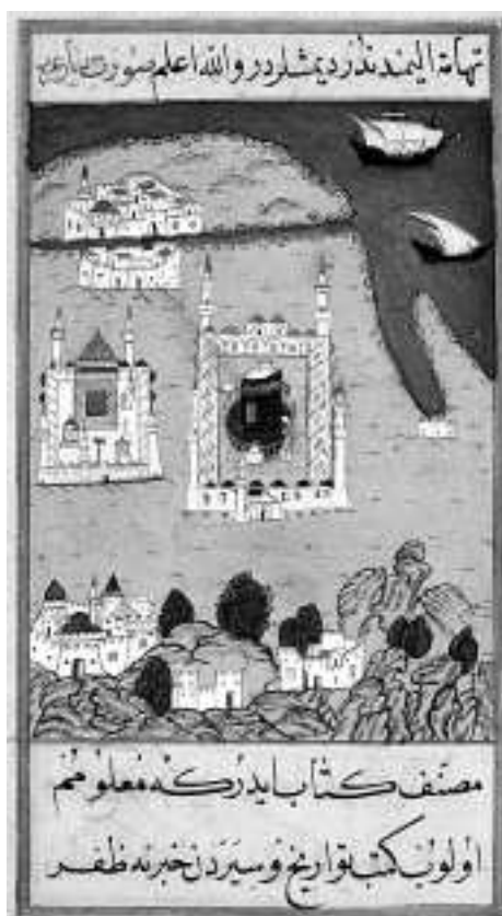
Image 6: Pseudo-Ibn Hawqal, Surat al-ard, Arabian Peninsula (University Library, Bologna, 3611, f 367a; Ottoman Turkish translation).

When appropriating earlier—mostly Arabic and Persian but occasionally also Greek—maps and geographies, the Ottoman court sponsored a variety of styles. Beautifully coloured maps adorn major textual representatives of earlier Islamic cartographic, geographical and cosmographic traditions. The texts were often translated into Ottoman Turkish and illustrated either in accordance with their ancestral patterns or in agreement with contemporary style and taste. One example is the maps attached to the Turkish rendition of Ibn Hawqal’s work. These maps reflect Ottoman Turkish preferences for artfully designed and executed pictorial maps that could come close to genre paintings. The inclination to treat maps like miniatures is also visible in the illustrations of non-mathematical cosmographies. The use of colours, of gentle, soft flowing forms and the integration with the text indicate that the producers of the specimens meant their work to be perceived by the customer as splendidly executed objects of the art of the book.