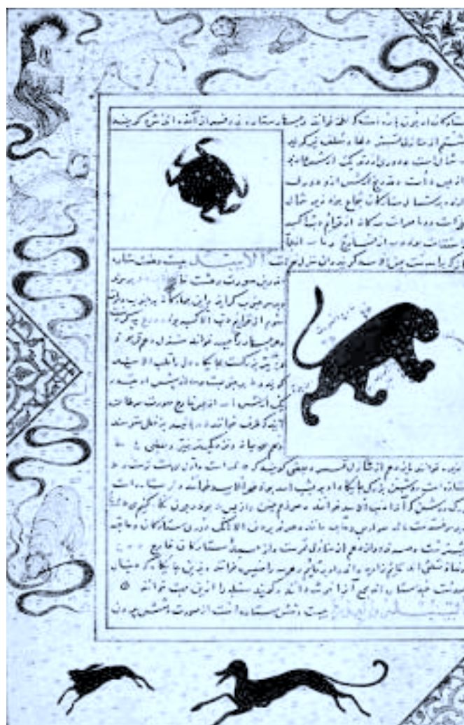
Image 5: Anthology for Iskandar Sultan, Cancer and Lion, at the margin: Majnun in the desert with animals.

ones. He pushed the verification of the discussions and goals of all of [these sciences] forward to a degree that the gifted and masterful [students] of this art had not yet achieved. In each of these sciences he discovered marvellous questions and astonishing issues according to the expression, ‘the masters of power are [ever] inspired’, as well as delicate finesses; and all this thanks to God’s grace which He dispenses on whom He wishes.