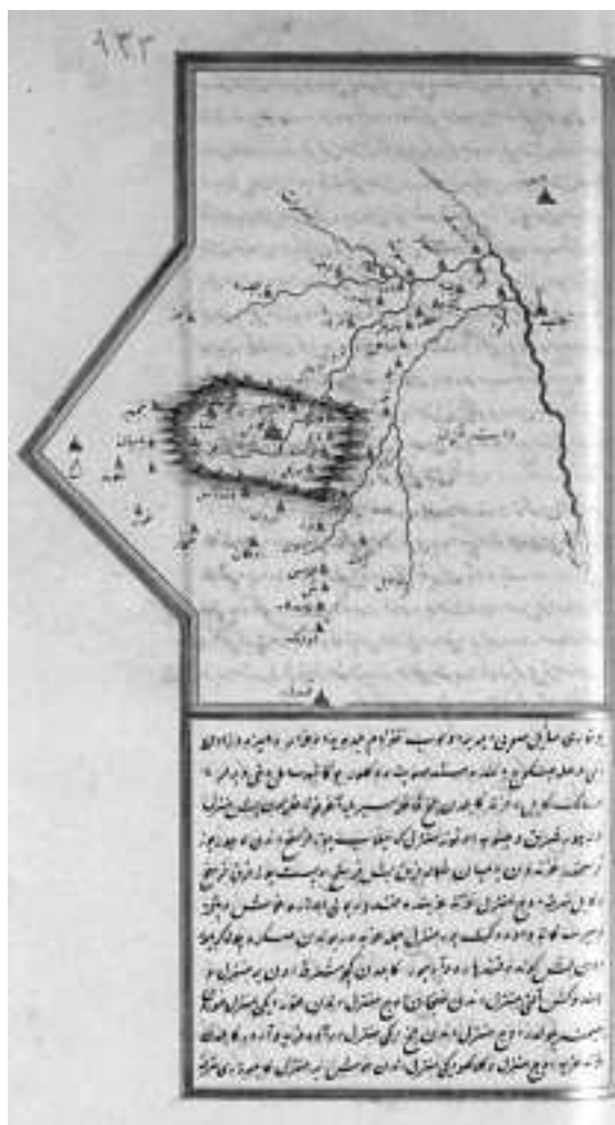
Image 9: Hajji Khalifa, Cihannüma , Kabul (Paris, BnF, Supplément Turc 215, f137).

The painters of these maps were not mere copyists. They also completed the unfinished images of the autographs, corrected them occasionally according to more recent cartographic models and added new maps based on eighteenth-century products from Germany or France that had arrived in Istanbul. In contrast to this approach to foreign cartographic specimens, the maps accompanying Abu Bakr al-Dimashqi's rendition of the Atlas Maior preserved visibly their foreign origin in the fine copy made for Sultan Mehmet IV (r. 1648-1687) as well as in many later copies. They were visually and materially independent of the text. In some manuscripts the maps were attached to the wrong chapters and clearly stitched in long after the text had been written.