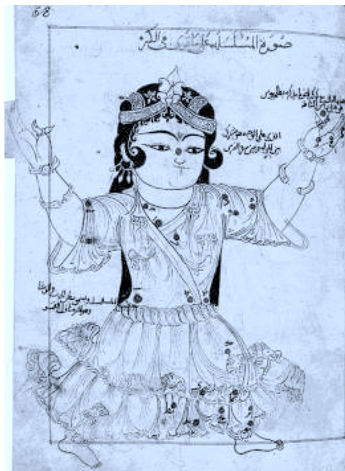
Image 3: 'Abd al-Rahman Sufi, Star Catalogue, Andromeda (BnF, Arabe 2489, f68; 665h/1266-7).

Andromeda sacrificed to a sea monster, and her saviour Perseus. The new pictorial programme introduced from the east comprises royal figures, men and women, in their fineries wearing crowns and jewels and sitting occasionally on thrones accompanied by servants and warriors.