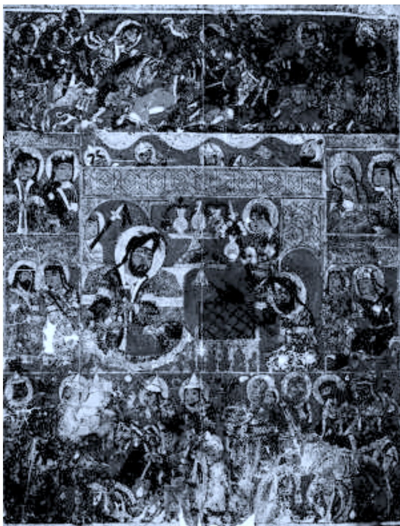
Image 2: Pseudo-Galen, Kitab al-Diryaq, Frontispiece (ÖNB, Vienna, A.N. 10).