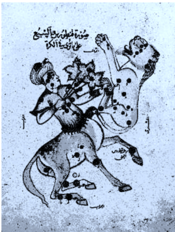
Image 4: 'Abd al-Rahman Sufi, Star Catalogue , Centaurus with the Wolf (BnF, Arabe 5036, f238a, 1430-40).

A major area of Timurid courtly patronage for the sciences was the copying and illustrating of scientific treatises in courtly kitabkhane s or workshops for illustrated and illuminated manuscripts. The connection between the arts and sciences was not limited, as it was often believed, to the occult and the popular such as magical bowls or miraculous illustrations. Neither was it stereotypic and conventional. Illuminated scientific works profited from the innovative changes that took place in the arts, from the new views on which scholarly disciplines should be sponsored by princely and other courtly patrons, and from an opening of disciplines – ones which previously had pursued rather austere modes of the visual – to artistic illustration. Splendid examples are a copy of the astronomical handbook compiled at Ulugh Beg's (r. 1409-1449) court in Samarkand with his personal participation, and illustrated for his library, and the excellent colour images of the stellar constellations in 'Abd al-Rahman al-Sufi's Star Catalogue , also produced for Ulugh Beg's library. 15