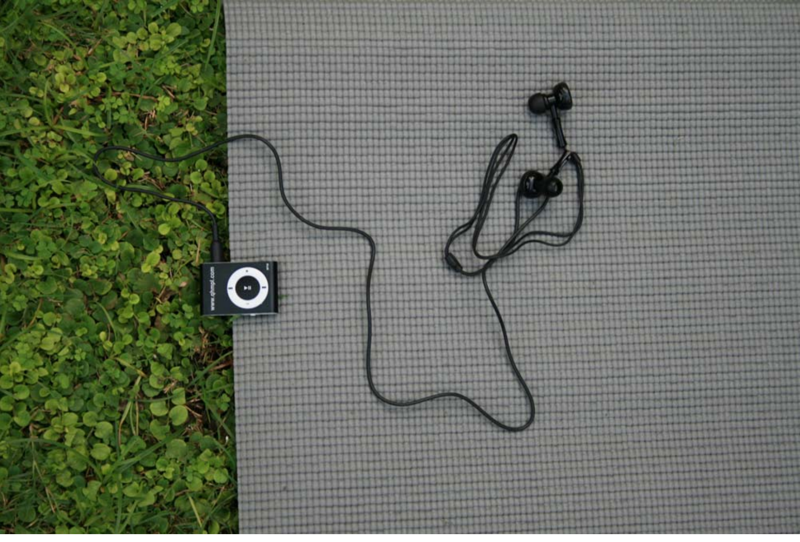
We are Starstuff, (detail)

For the Sarai City-as-studio open day I put together 2 audio pieces, Eclipse and Cathexis , both 10 minutes long, both strung together from the various conversations. The audio pieces were played on 10 MP3 players arranged in the garden outside Sarai. People were invited to lie down in the garden, under the sky and listen to them.