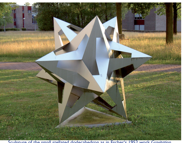
Sculpture of the small stellated dodecahedron as in Escher's 1952 work Gravitatii University of Twente

People and Their Representations in the Iberian World and Beyond