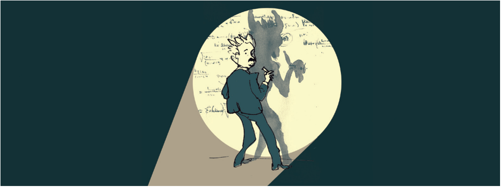
Laurent Taudin, 2008

quasi-religious status as the key to the mysteries of the world.