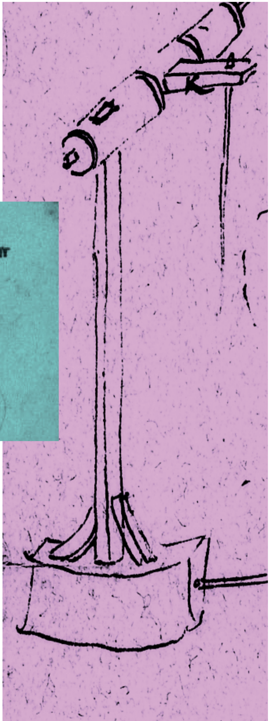
Drawing of a pendulum in a manuscript by Heinrich Schickardt

Max Planck Institute for the History of Science